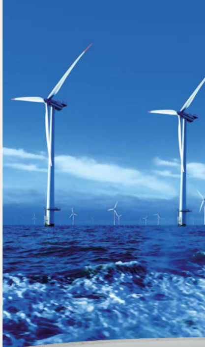
3 MW-class blade bearing, ► hydraulic pitch